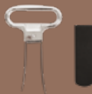
CAVATAPPI A LAME BLADED CORKSCREW 78400008